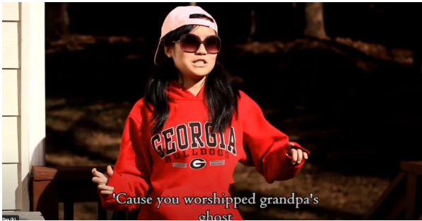
Chinese Dynasties Song: China Got Back https://youtu.be/-2ibWoCt4GU?si=UwPgvSOQuKadTUfx

Application Used iMovie, camera, notes, pages