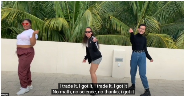
AP World Chinese Dynasties Song: Chinalicious https://youtu.be/gAH5TNilvfo?si=6mEy7-NBmO3_8TCo