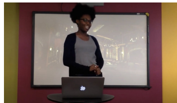
Student Presentation https://youtu.be/JMPjoAlPrPY